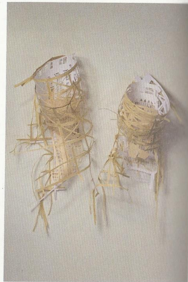
Door de Mand. Paper cuts 25 x 30 x 65 cm, 25 x 30 x 80 cm, 2012