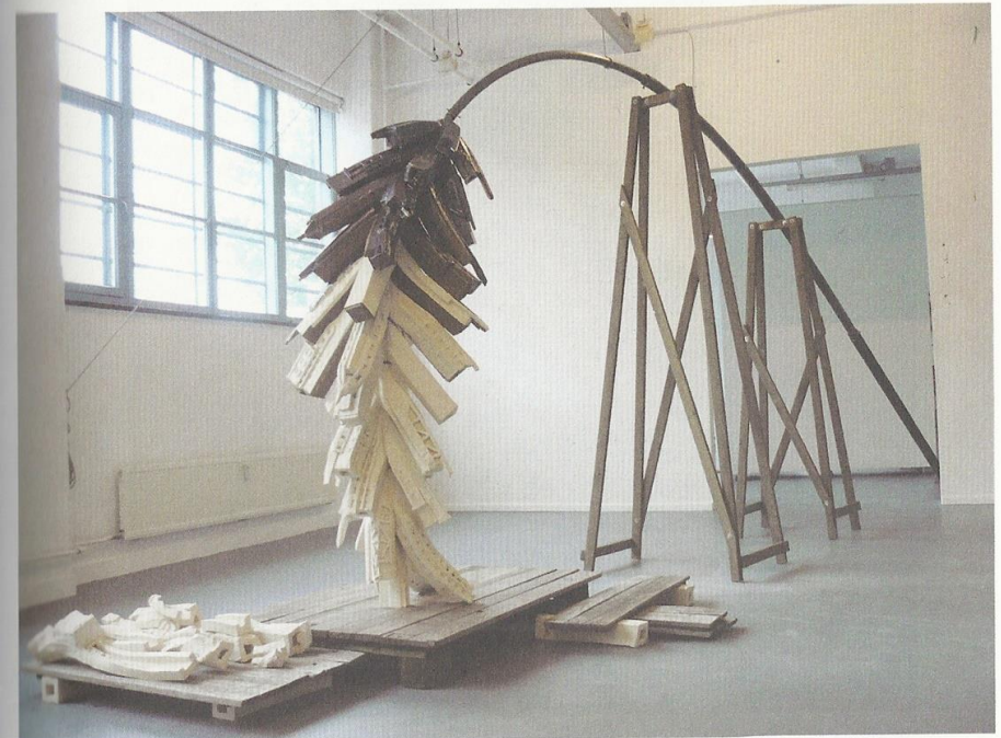
Wie Zaait Zal Oogsten. Ceramics, metal, wood, 500 x 150 x 250 cm, 2012