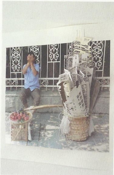
Her Wish To Deny It. Paper cuts on photo print 105 x 80 x 28 cm, 2012